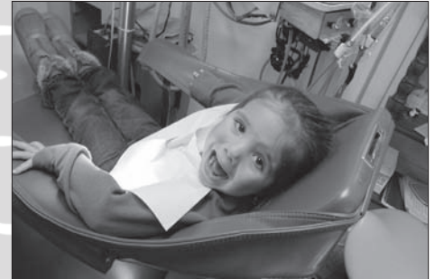
A youngster having their first dental appointment

As we’ve worked through the process of organization, with the participation of our social service agencies, school nurses and our dentist, we’ve learned a lot about what needs to be done to ensure every child in our area has access to quality, affordable oral health care. We believe that by eventually treating all of our children while they are still very young, we will be able to greatly improve oral health, which has the added benefit of reducing the cost of oral health care to their parents and to the community.